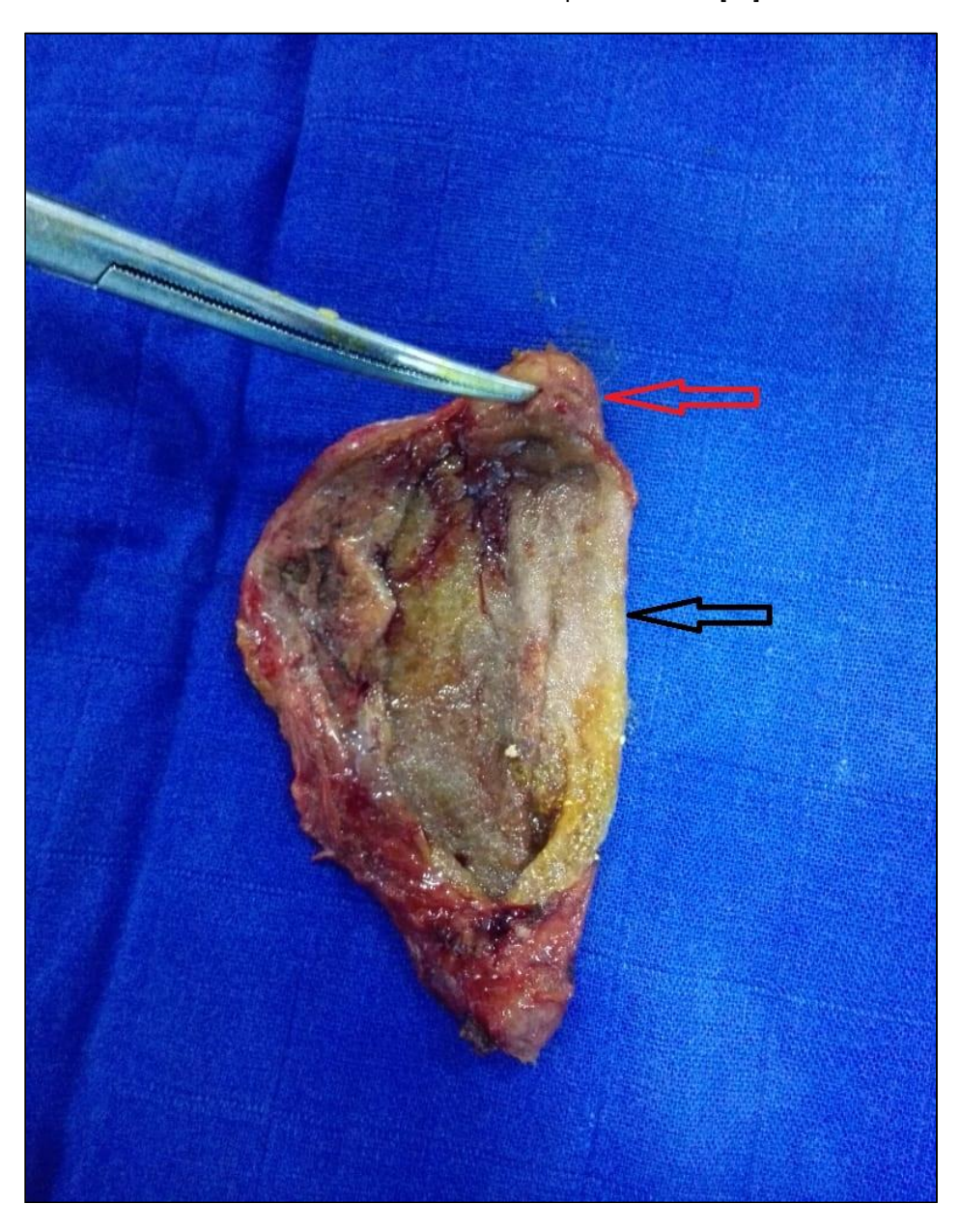
Fig. 3. The gallbladder with gastric mucosa (red arrow) and mucous membrane of the gallbladder (black arrow)

Gastric heterotopia in the gall bladder may be asymptomatic or in the form of pain in the right hypochondrium radiating to the right shoulder, as in our patient's case [11].