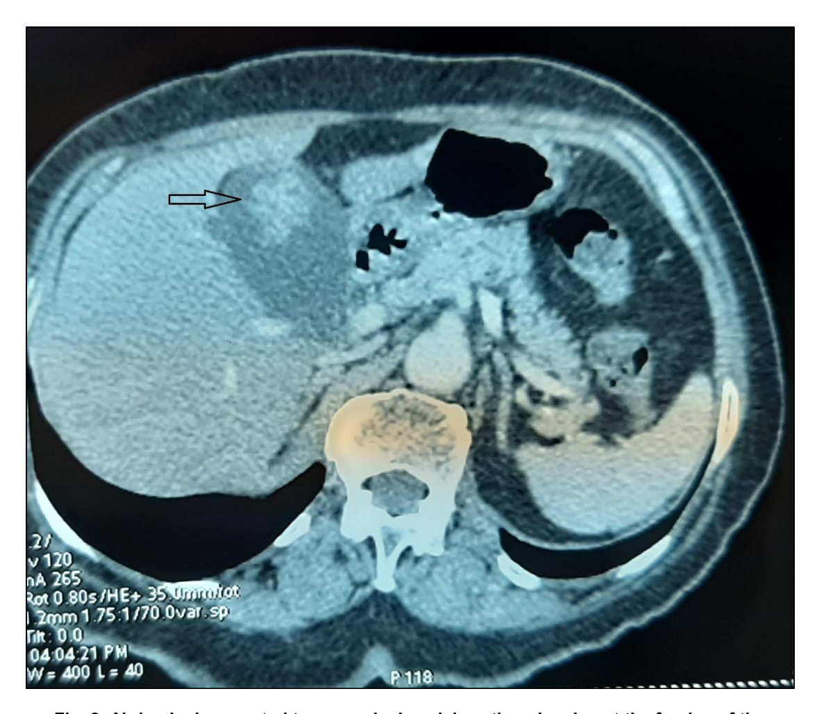
Fig. 2. Abdominal computed tomography in axial section showing at the fundus of the gallbladder an endoluminal formation

The tumor markers carbohydrate antigenic determinant 19-9 (CA 19-9) and carcinoembryonic antigen (CEA) were normal.