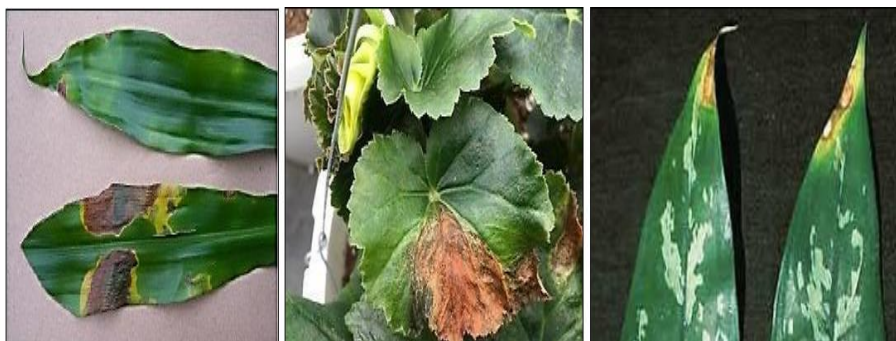
Fig. 1. Leaf spots due to fluoride toxicity