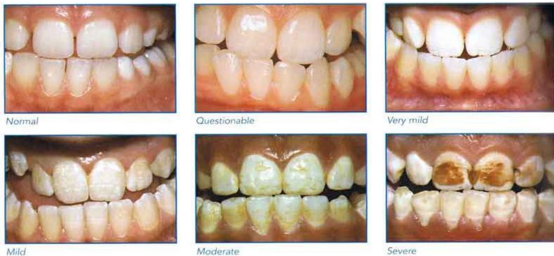
Fig. 3. Effect of fluoride on dental fluorosis