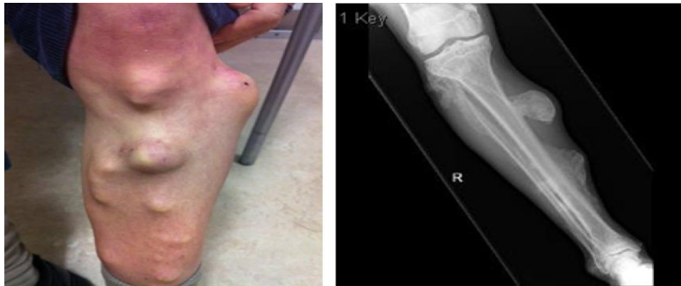
Fig. 4. Effect of Fluoride on bones