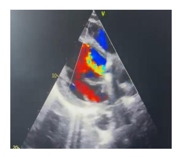
Fig. 3. Moderate aortic paraprosthetic leak