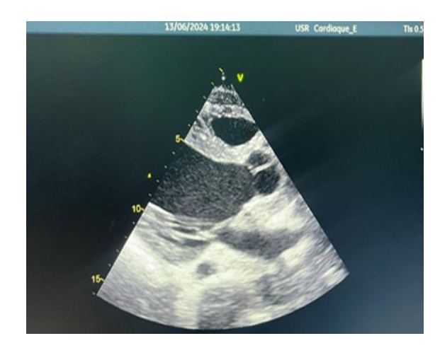
Fig. 4. Post-operative evaluation of the aortic valve: parasternal long-axis and short axis views