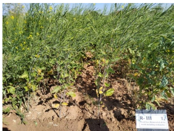
Fig. 2T 8 . Weed free (Removal of allweeds includingorobanche)