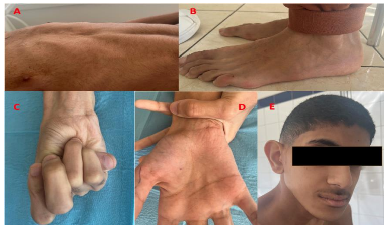
Fig. 1. Skeletal anomalies. A: Moderate pectus excavatum B: Flat feet C: Thumb sign D: Wrist sign E: Particular facial features

After consultation with the cardiologists, there was no urgency to start beta-blockers as a preventative measure, close cardiac monitoring was proposed. Annual ophthalmological monitoring is planned. Vitamin D supplementation as well as anti-flu, anti-pneumococcal and anti-covid19 vaccinations and physiotherapy were prescribed.