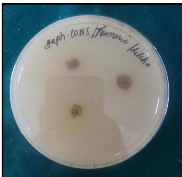
Fig. 3. The image shows the zone of inhibition of turmeric against Coagulase-negative staphylococci