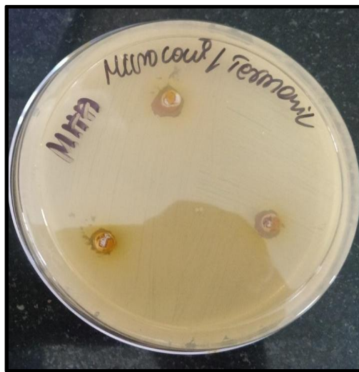
Fig. 1. The image shows the zone of inhibition of turmeric against micrococcus