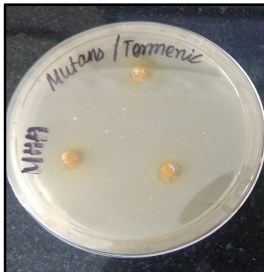
Fig. 2. The image shows the zone of inhibition of turmeric against Streptococcus mutans ,