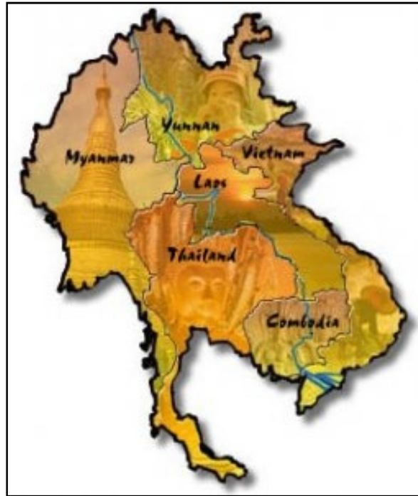
Fig. 2. Thailand map and border countries