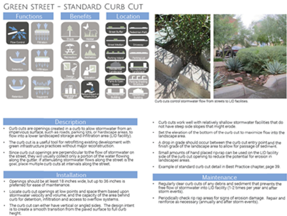
Figure 6. LID tool page - Green Street - Standard Curb Cut