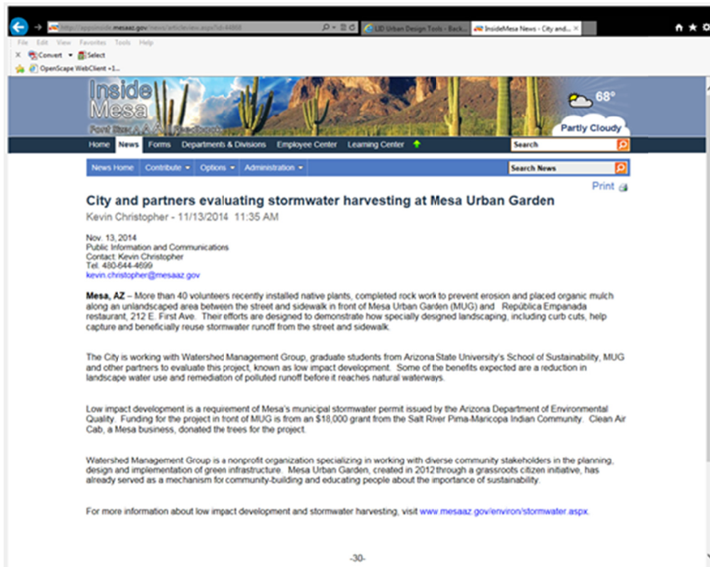
Figure 7. Inside Mesa news -City and partners evaluating storm-water harvesting at Mesa