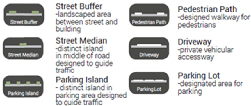
Figure 3. Location specific LID tools for Transportation, Source: Low Impact Development Toolkit, 8

Some of the LID tools are specific to certain locations and types of development. Transportation projects have a huge part to play in the implementation of best management practices, as many of these may be included in the scope of work of what gets designed and implemented. Included below is a diagram of the some of the toolkit proposals that may be included in transportation projects. However, the tools will only be beneficial if their design, implementation and maintenance also includes LID concepts.