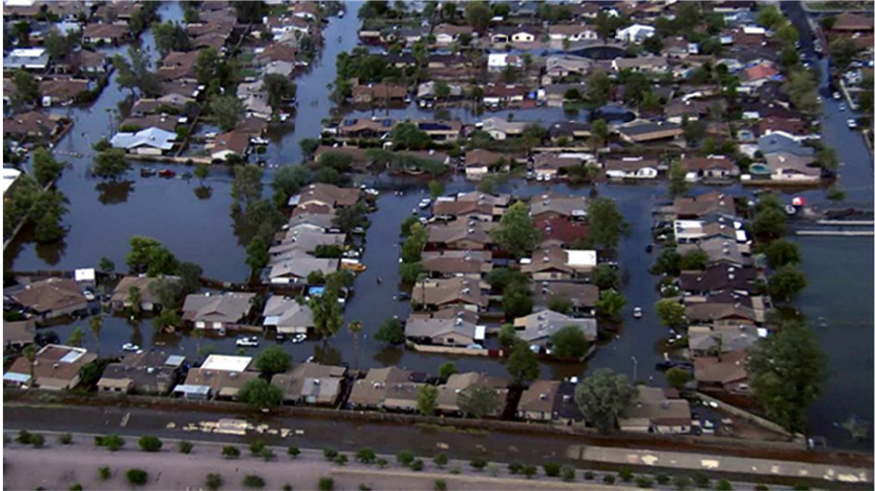
Figure 1. 2014 Flooding - City of Mesa, Arizona

Transportation projects have the potential to assist with better management of water if managed close to its source. Projects may also provide reductions of runoff volume and velocity downstream if the implementation and construction of these projects includes LID proper drainage infrastructure, installation of medians that include native vegetation and landscape improvements, and irrigation systems that are true to the LID concepts. When LID is brought forward to the Transportation field, the implementation of potential actions addressed in the LID Toolkit are beneficial and possible as the LID is adaptable to a wide range of land uses and project scales (LID Toolkit, 1).