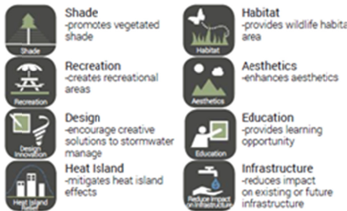
Figure 5. Benefits specific to LID tools, Source: Low Impact Development Toolkit, 8

The benefits of the LID tools are also represented with icons that allow the identification of the indirect benefits associated with each LID practice.