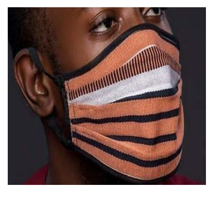
Fig. 3. Right use of face mask in the public