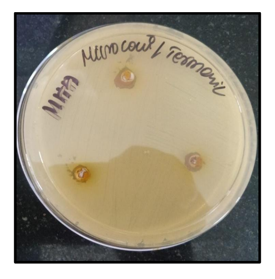
Fig. 1. The image shows the zone of inhibition of turmeric against micrococcus