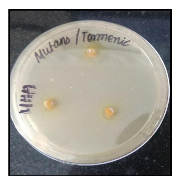
Fig. 2. The image shows the zone of inhibition of turmeric against Streptococcus mutans,

Fig. 1. The image shows the zone of inhibition of turmeric against micrococcus