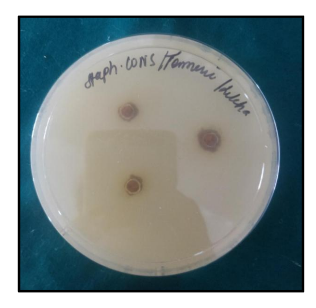
Fig. 3. The image shows the zone of inhibition of turmeric against Coagulase-negative staphylococci

Dhanasekaran and Muralidharan; JPRI, 33(58B): 65-73, 2021; Article no.JPRI.74349