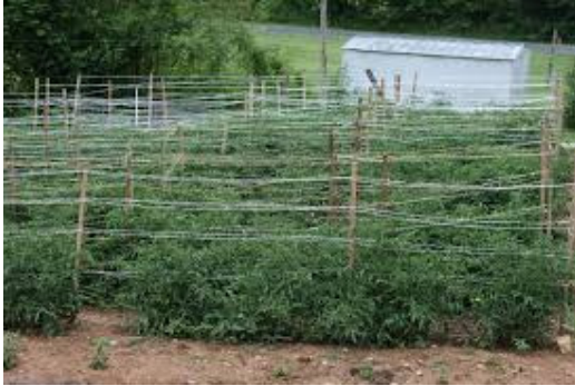
Fig. 2. Cage trellising method of tomato